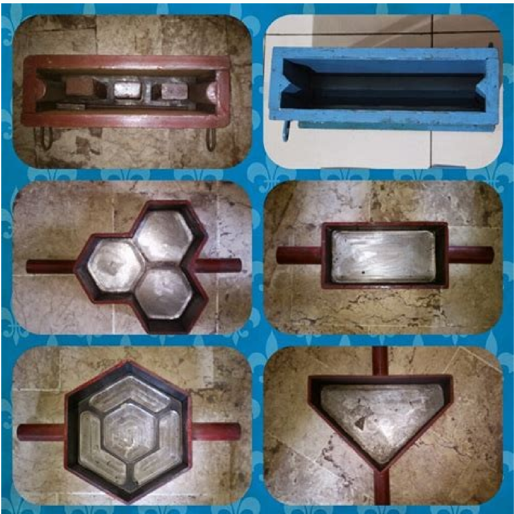
Harga cetakan batako press manual jakarta.